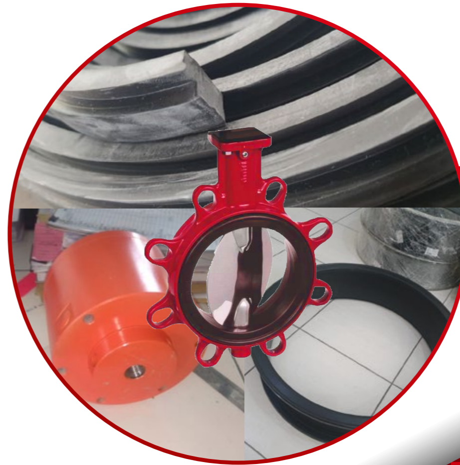
SPARE PARTS REPLACEMENT