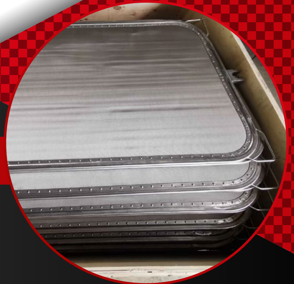
FILTER LEAVES REMESHING